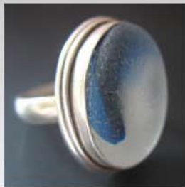
Sea Glass Jewelry

Offering an amazing array of sea glass and sea glass products! As seen in Coastal Living Magazine.