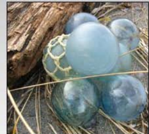
Vintage Glass Floats