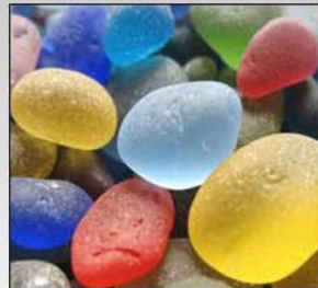
Bulk Sea Glass