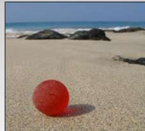
Sea Glass Photos