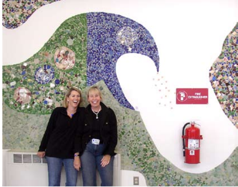
This sea glass mural is a tribute to a close friend who worked in coastal conservation and who had passed away.

the public in 2006 and is now part of the Boston Harbor Islands National Recreation Area ( www.nps.gov/boha/ ).